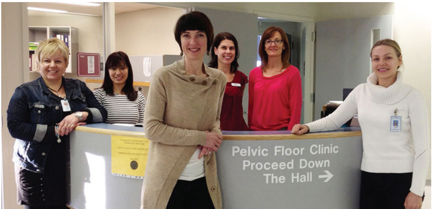
Staff at the Saskatoon Pelvic Floor Pathway Clinic help patients explore their options.

targets on visibility walls. Front line workers can see how their work contributes to the goals of the organization and the health system.